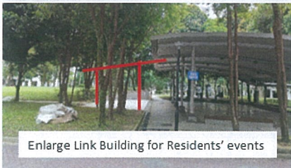
Enlarge Link Building for Residents' events